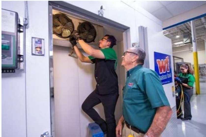
Individuals portrayed in photos are actual students, graduates, or employees of WTC.