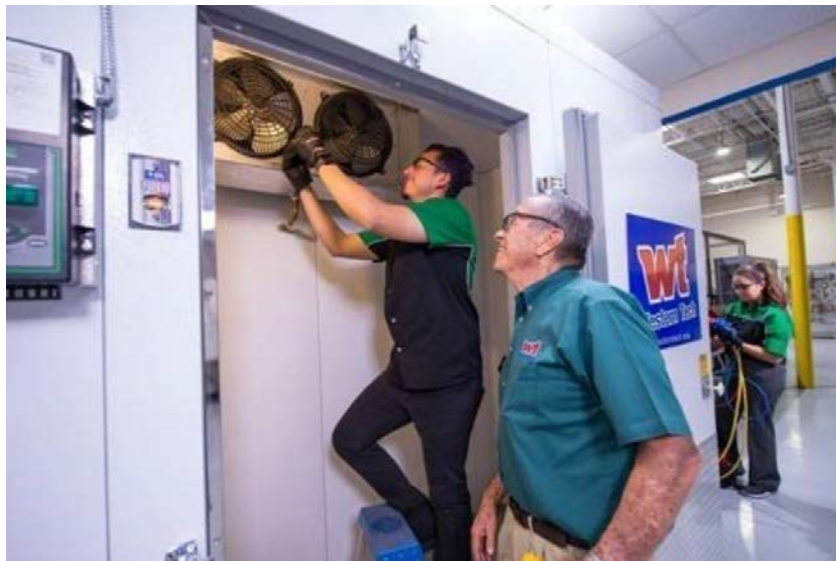
Individuals portrayed in photos are actual students, graduates, or employees of WTC.