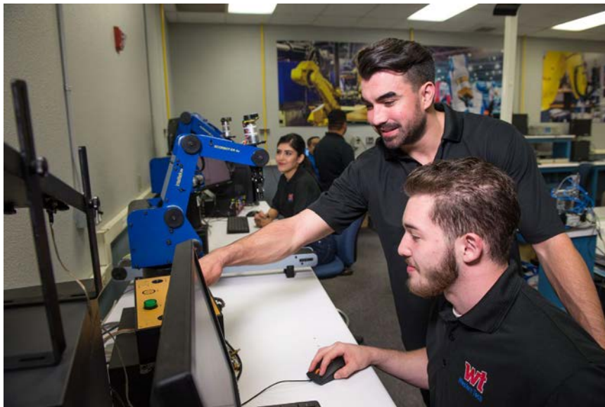
Individuals portrayed in photos are actual students, graduates, or employees of WTC.