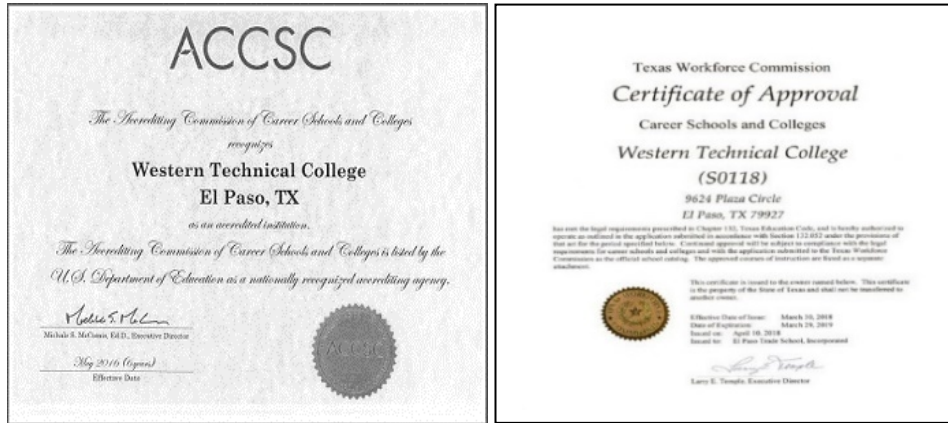
(The original accreditation and licensure documents are displayed at each campus)