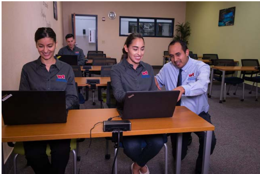
Individuals pictured above are actors, students and/or employees of WTC

This program is offered 100% online at the Branch Campus (Diana Drive) and Hybrid at the Main Campus (Plaza Circle)