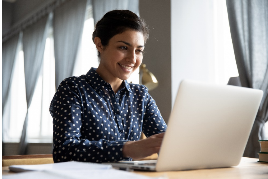
Individuals pictured above are actors, students and/or employees of WTC