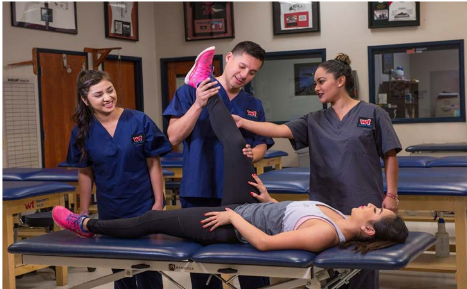
Individuals portrayed in photos are actual students, graduates, or employees of WTC.