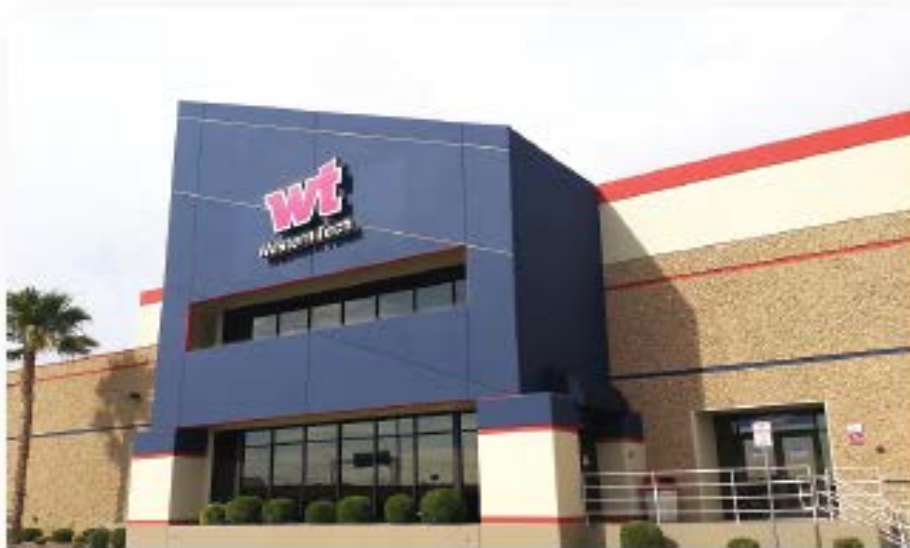
MAIN CAMPUS 9624 Plaza Circle El Paso, TX 79927 (915) 532-3737 • 1-800-225-5984