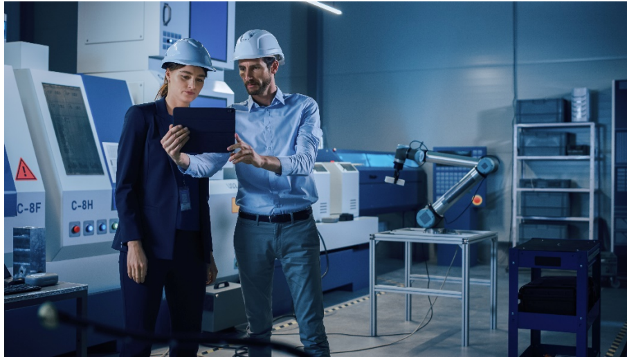
Individuals pictured above are actors, students and/or employees of Western Tech

Available at 9451 Diana Drive Campus (Online)