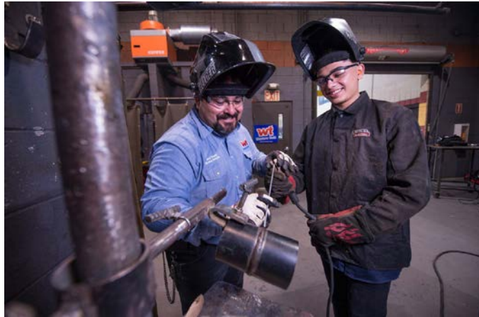
Individuals portrayed in photos are actual students, graduates, or employees of WTC