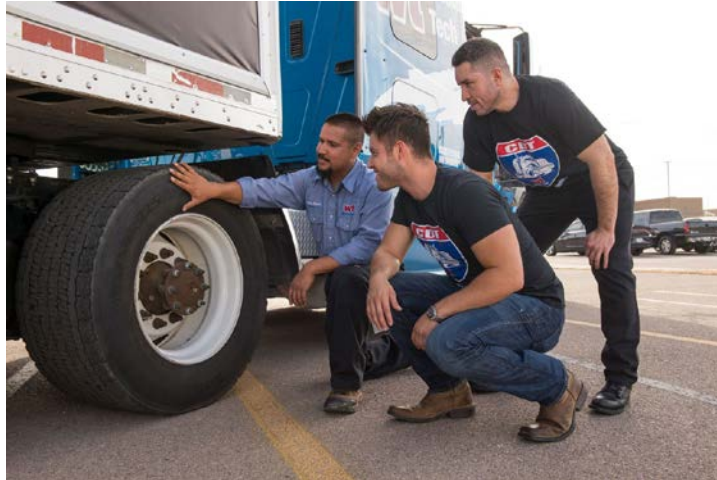
Individuals portrayed in photos are actual students, graduates, or employees of WTC