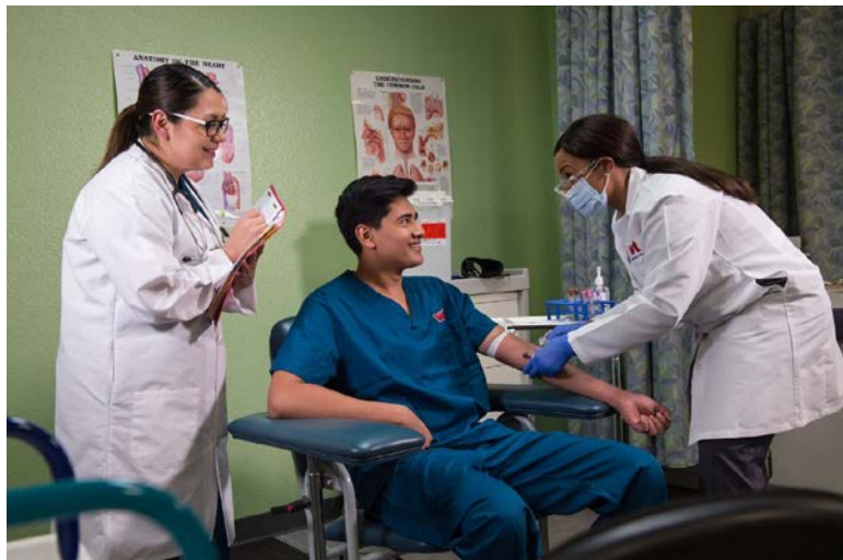
Individuals portrayed in photos are actual students, graduates, or employees of WTC.