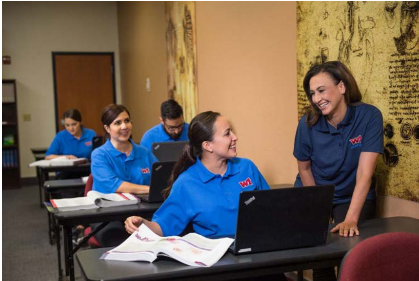
Individuals portrayed in photos are actual students, graduates, or employees of WTC.