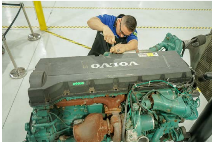
Individual portrayed in photos are actual students, graduates, or employees of WTC.