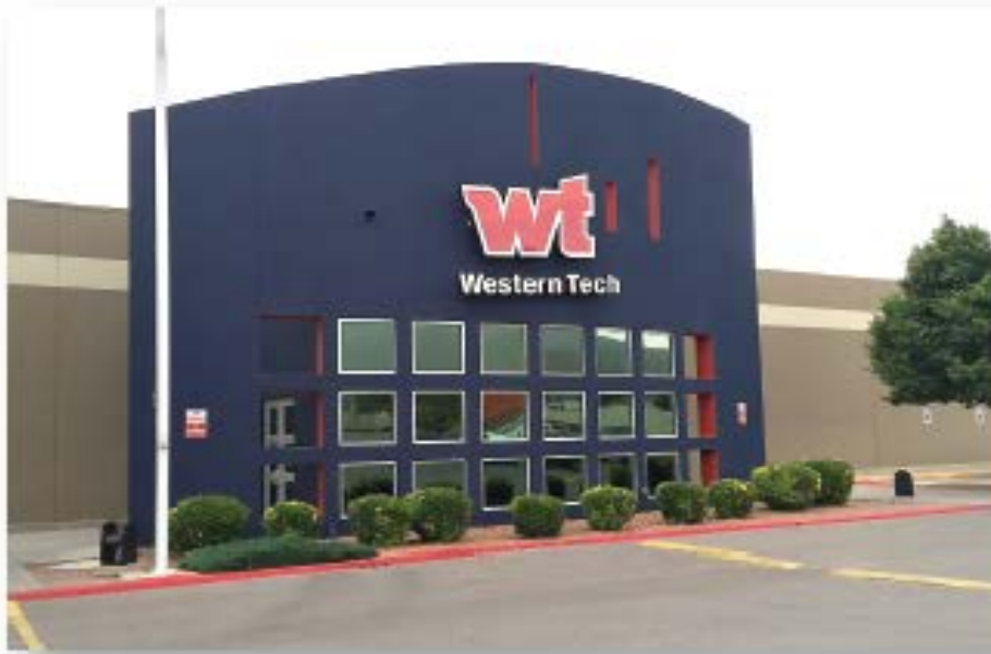
BRANCH CAMPUS 9451 Diana Drive El Paso, TX 79924 (915) 566-9621 • 1-800-522-2072