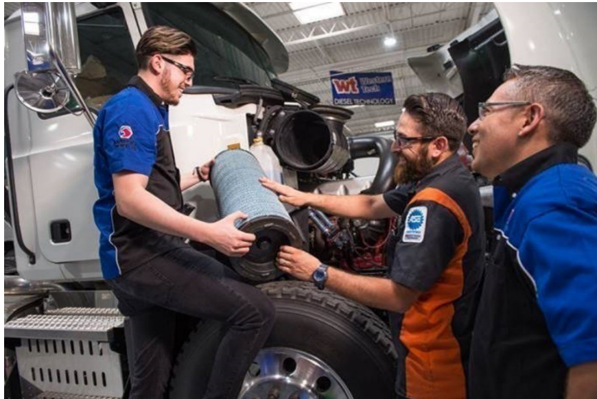
Individuals portrayed in photos are actual students, graduates, or employees of WTC.