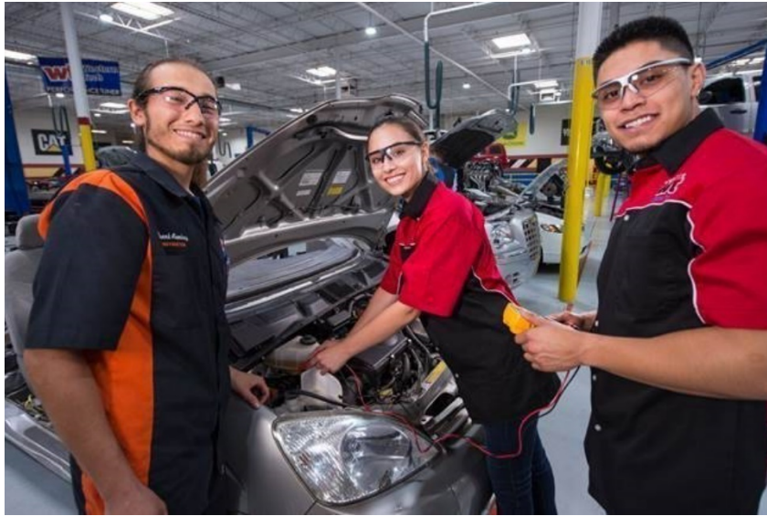
Individuals portrayed in photos are actual students, graduates, or employees of Western Tech